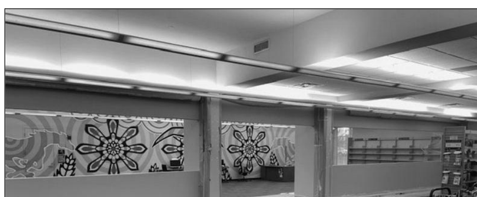
Mustang Public Library next summer will begin offering story and fairy walks, made possible by a health and literacy grant through Oklahoma Department of Libraries. Also on tap is current construction of a wall providing a special space for teens at the library, expected to be completed "in the near future," officials say.

Mustang is one of 36 libraries across the state to be awarded grant funds totaling more than $220,000. The Oklahoma Health Literacy Grants